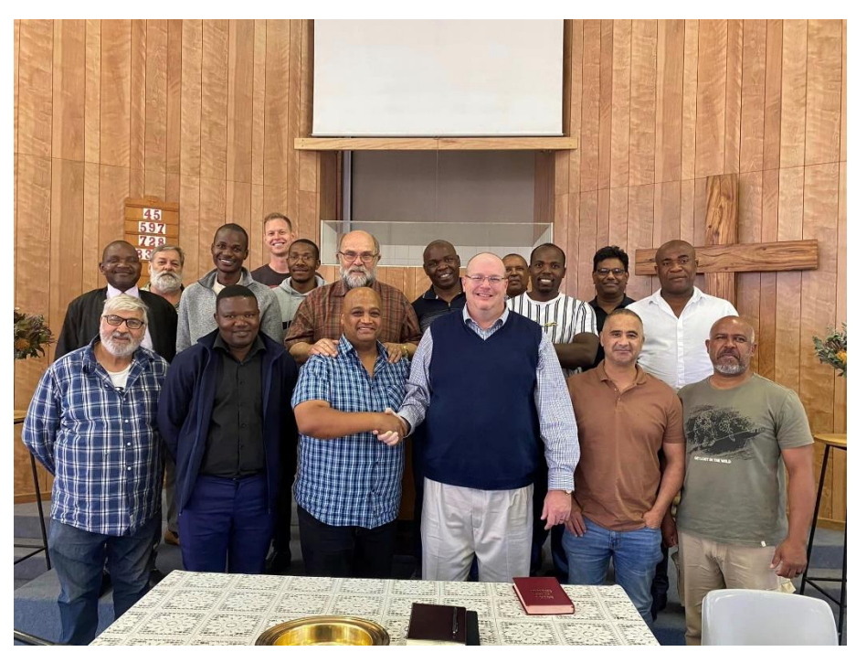
Preaching Workshop in Cape Town, South Africa (December 3, 2022)

Doctrines of Men: A Comparative Study of Denominational Doctrines and the Word of God