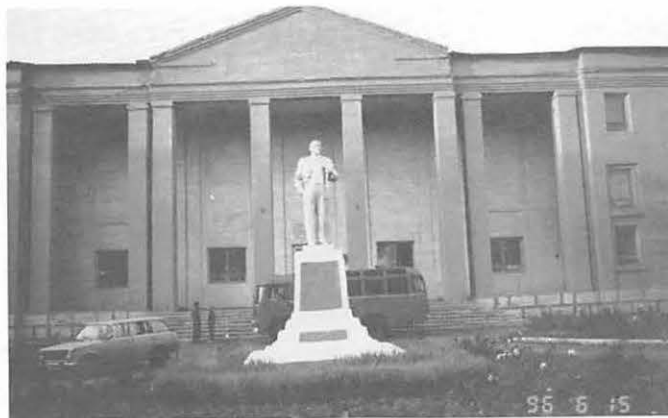
Gorky Palace -- The Proletarsky church meets in a room in this building in Donetsk, Ukraine.

On June 23rd we said good-bye to our Ukrainian friends, and the campaign coordinators who are working long-term with the three congregations involved, and began the long journey back home with stops in Kiev, Vienna and Atlanta. It was a wonderful privilege to participate in such an effort. I have grown because of it. I pray that much and lasting good has resulted. -10822 Mabelvale West Road, Mabelvale, AR 72103.